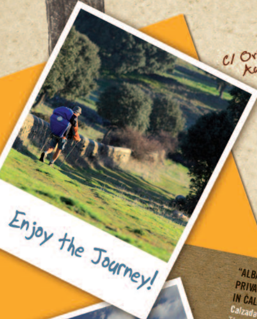
Enjoy the Journey!

Private Hostel "CASA ALBERGUE NENUFAR" in Valverde de Valdecasa C/ Iglesia, 13 T: +34 680 11 98 24 / +34 649 578 821 Accommodation: 10 people Rates: €5 Opening Hours: 24 h. Bookings available www.nenufar.nom.es nenufar09@gmail.com